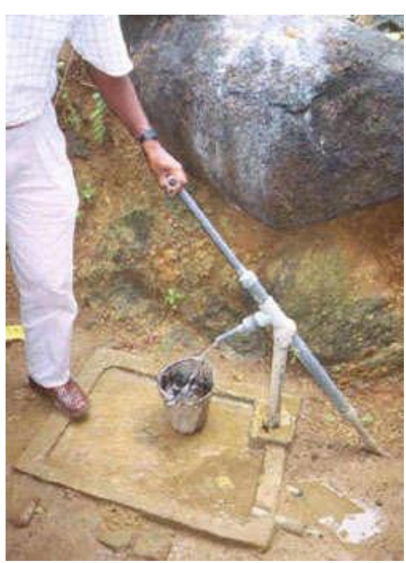
Figure 2: The Tamana pump installed at Batalahena Sri Lanka